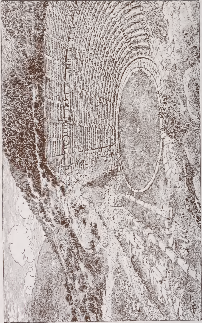
A Greek Theatre, showing seats cut in the side of a hill